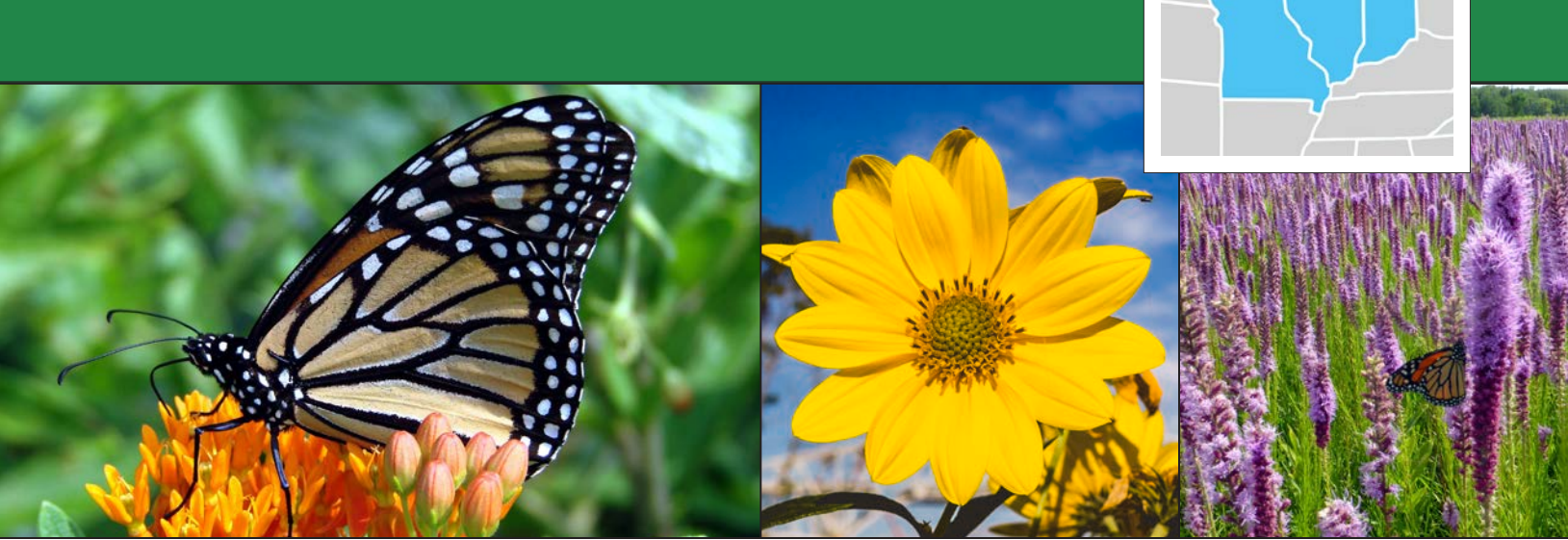
Left to right: Monarch on butterfly milkweed, sawtooth sunflower, and a monarch on prairie blazing star.

Beyond the agricultural patchwork of the Midwest states of Iowa, Missouri, Illinois, and Indiana lies vast tallgrass prairies, oak savannas, deciduous forests, and sprawling wetlands. These habitats are home to thousands of pollinating insects and other wildlife, including several imperiled species of bumble bees and butterflies. The Midwest is also a critically important breeding area for the monarch butterfly, which can be found in large numbers throughout the summer.