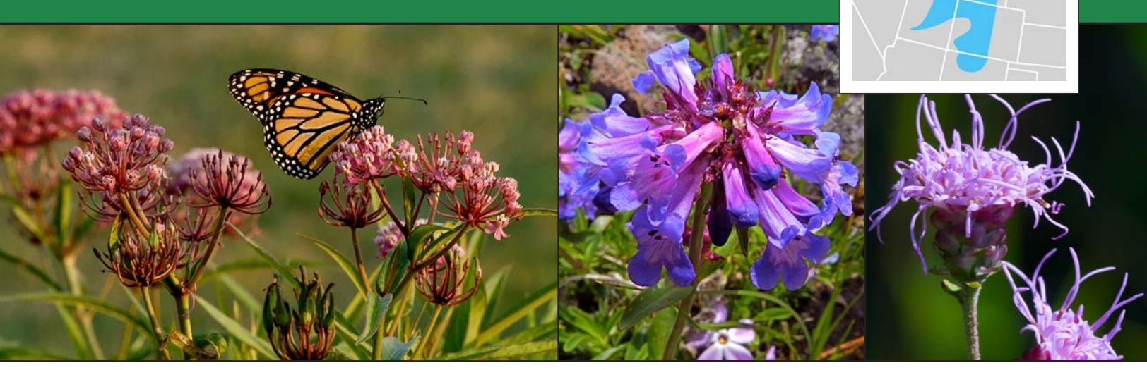
Left to right: Monarch on swamp milkweed, littleflower penstemon, and Rocky Mountain blazing star.

The Rocky Mountains region spans large sections of Idaho, Montana, Wyoming, Utah, Colorado, and New Mexico. It is characterized by some of the tallest mountains in the continental U.S. and is home to diverse forests, serpentine river canyons, and high alpine zones. A huge variety of plants and wildflowers, from tiny alpine blooms to large stands of rabbitbrush and goldenrod, can be found in this region. These plant communities support numerous pollinators and other wildlife, including summer-visiting monarch butterflies.