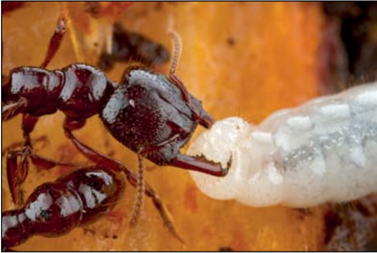
A larva of the Dracula ant (genus Amblyopone ) looks nothing like its adult sister. Photographed in Papua New Guinea by Piotr Naskrecki.

to expand rapidly. With air and hemolymph (blood) pumping into their tracheal frame, her wings appear to grow, turning into long, white veils that will eventually fold neatly onto her back. With this accomplished, the most dramatic event of this mantis's life is over. As she sits next to her empty nymphal "skin" (the "exuvia," in entomological parlance) it is hard to believe that this large, winged insect was once trapped inside. Looking closely at the structure of her body I can see not only her huge new wings, but also three small, lens-like structures on her head; these are the "ocelli," simple eyes that will help her orient herself while flying. On the underside of her body now sits her cyclopean ear, formed as a deep groove between her middle legs, which will allow her to detect ultrasonic calls of hunting bats; and her abdomen now carries fully developed reproductive organs. None of these structures were apparent on her body just a few hours ago.