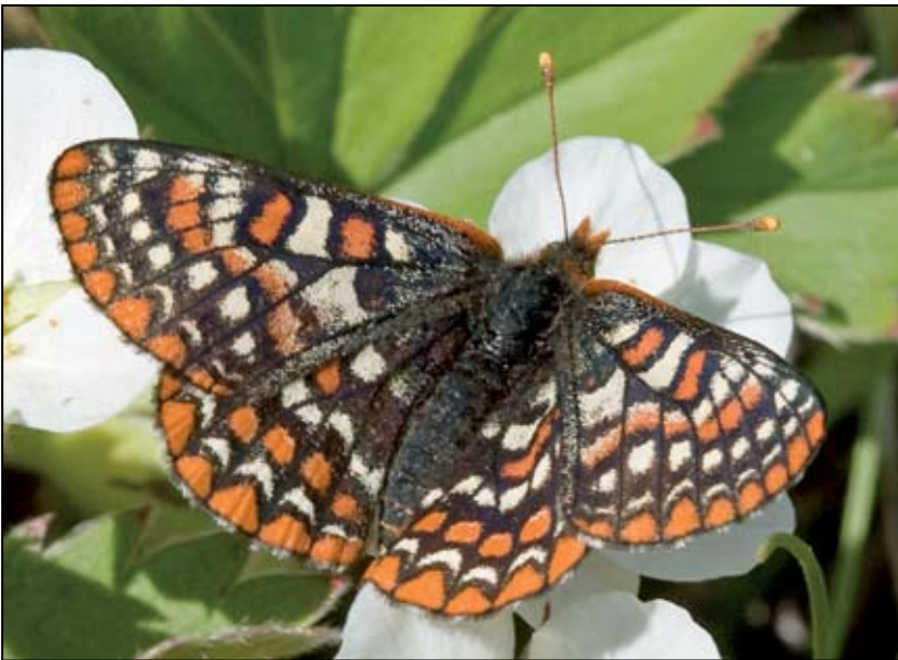
The aptly named checkerspot butterflies are distinguished by the orange, white, and black patterns on their wings. Taylor's checkerspot ( Euphydryas editha taylori) nectaring on wild strawberry