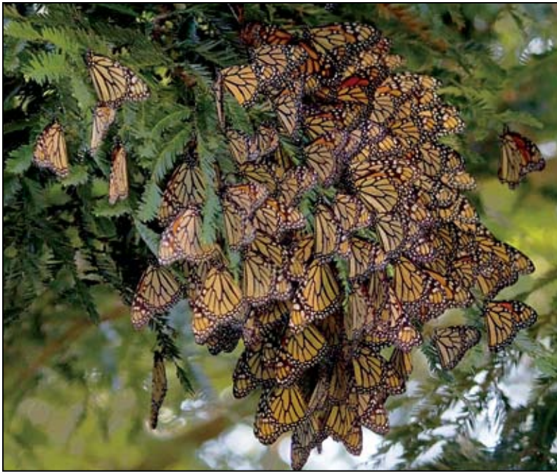
Data collected by volunteer monitors for more than a decade has produced a detailed picture of the status of monarchs overwintering along California's coast.

Find more information about Xerces' citizen-science projects at www.xerces.org .