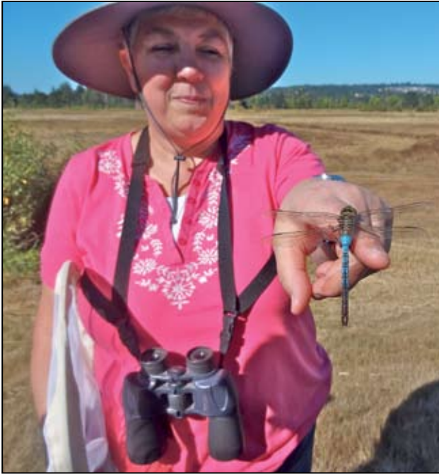
Citizen-science projects allow close-up encounters with wildlife that otherwise might only be glimpsed as it flashes by.

species declines, create climate-change models, and discover the complex geometry of biochemical molecules.