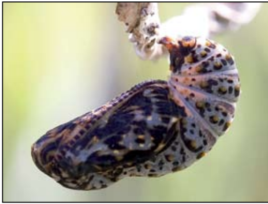
Taylor's checkerspot spends much of the year (from late summer to the following spring) as a chrysalis.

with the Washington Department of Fish and Wildlife and others to convene researchers and conservationists with the goal of sharing knowledge of Taylor's checkerspot and compiling all of the known information in one place. From there we developed plans to detail next steps to conserve this butterfly.