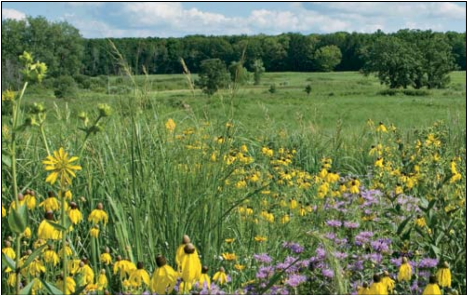
This bucolic landscape is bounded by freeways and housing, yet thoughtful management has created the right conditions to support nearly a dozen species of bumble bees, including the nationally rare rusty patched bumble bee ( Bombus affinis ).

The Arboretum recognizes how important its land is for bumble bees, and also, in turn, how important bumble bees are for maintaining healthy plants and sustainable ecosystems. It provides a refuge for both common and imperiled species, and its efforts highlight the significance of bumble bees in the landscape in such a way as to generate public support for the care of bumble bee populations. Through its management and its programs, the Arboretum has established itself as a regional center for bumble bee conservation.