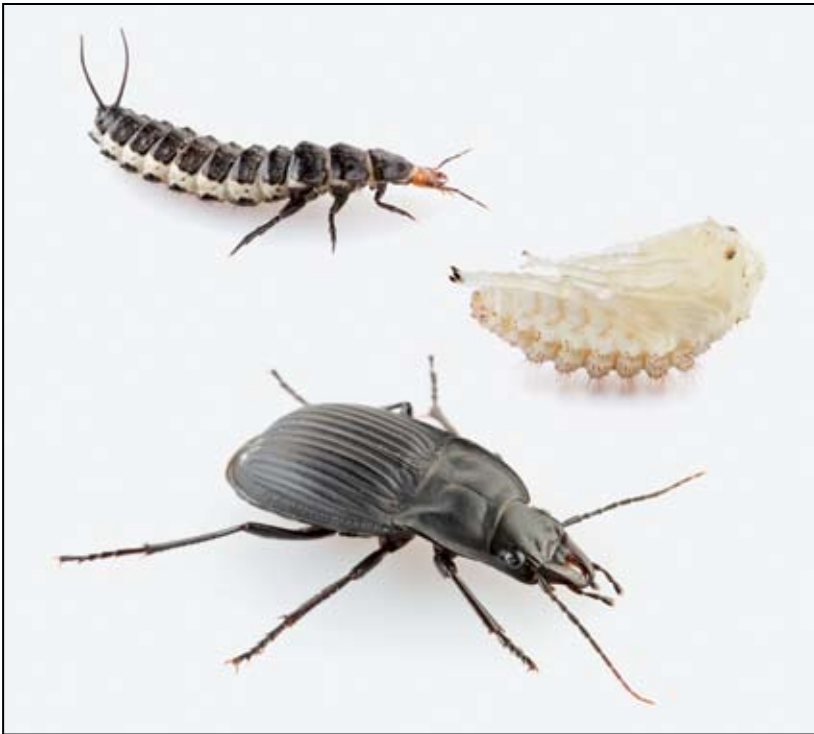
This series of images shows three of the four phases of holometabolous insect development: larva, pupa, and adult. The egg is not shown. Ground beetle ( Dicaelus dilatatus ), photographed by Piotr Naskrecki.

mobile larval stage known as the “planidium,” which actively searches for its host before turning into a more typical feeding larva.