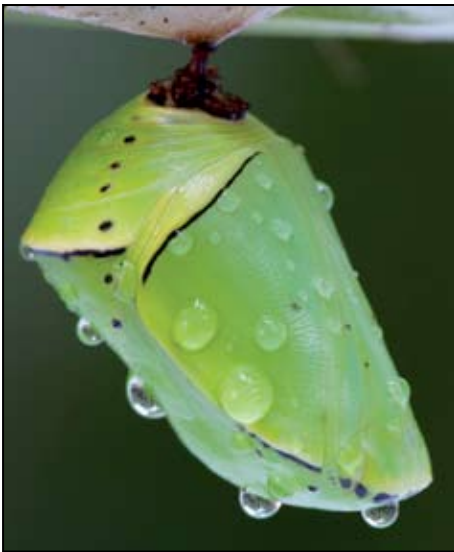
A butterfly chrysalis is perhaps the most readily recognized symbol of insect metamorphosis. Chrysalis of a leafwing (genus Anaea ), photographed in Suriname by Piotr Naskrecki.

In a process known as “hypermetamorphosis,” some insects, often those parasitizing other species, have a highly