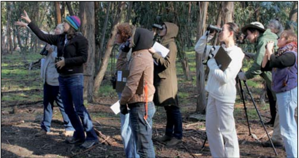
Training workshops, such as this one in the monarch grove of the Ardenwood Historic Farm, prepare citizen scientists to continue a tradition of skilled amateur natural historians that stretches back for centuries.