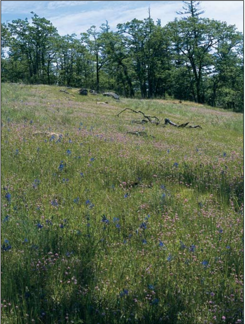
The wildflower-rich grasslands that many butterfly species rely upon are disappearing from modern landscapes. In Oregon's Willamette Valley, grasslands have been lost to agriculture, urban development, and invasive plants. Less than 1 percent of the Valley's historical area of prairies now remains.