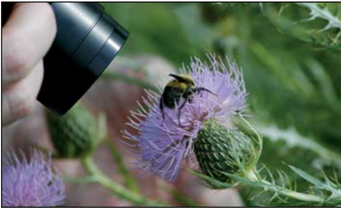
Digital photography and the internet can connect citizen scientists with national experts.

Not only are citizen-science projects swelling in popularity, they are increasingly influential in the scientific community. A quick keyword search for “citizen science” in the Web of Science, a scientific-journal database, shows just a handful of articles in this realm published before 1996. Since then the number of articles per year has grown rapidly; nearly a hundred were published in 2012. Data from citizen-science projects are being used to find rare organisms, track migration patterns, detect