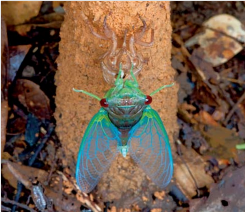
Immediately after emerging from the nymphal skin, adult insects pump fluids to expand their wings and other newly exposed body parts. Freshly emerged cicada clinging to a clay turret built by its nymphal stage in preparation for emergence, photographed in Suriname by Piotr Naskrecki.

The answer to this deceptively simple question is twofold. The physical reason for molting—“ecdysis,” a process that marks the transition from one stage of an arthropod’s life cycle into another—is clearly dictated by the nature of its skeletal structures. Unlike a vertebrate’s internal skeleton, which provides muscle attachments and does not constrain the growth of tissues surrounding it, an arthropod’s chitinous exoskeleton has a limited ability to expand and must be shed periodically to