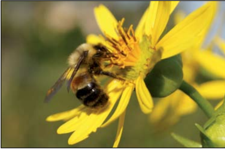
Rusty patched bumble bee ( Bombus affinis ), photographed by Christy M. Stewart, a participant in Xerces' Project Bumble Bee.

to understand dragonfly migration in North America and to promote conservation of the wetland habitats on which dragonflies rely. The group is developing an international network of citizen scientists to investigate dragonfly migration via three avenues: Pond Watch, Migration Monitoring, and the Stable Isotope Project. In 2012, more than two hundred people submitted 725 reports, and six hundred specimens were collected for stable-isotope analysis. The knowledge gained expands our understanding of dragonfly migration routes and timing in North America. These contributions also will be useful in focusing future conservation efforts.