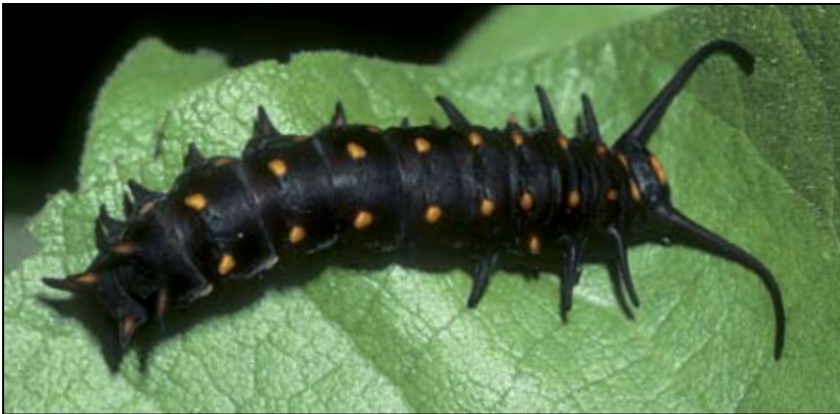
No animals symbolize change as much as butterflies, with their dramatic transformation from crawling caterpillars to flying adults. Pipevine swallowtail ( Battus philenor ), photographed by Bryan E. Reynolds.

Over the last couple of years our citizen-science activities have expanded to embrace other, very different groups