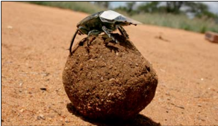
Dung beetles were fitted with hats to block their view of the sky. This hat is clear, a control in the experiment.

Native bees are better pollinators. An international team of researchers, including several of Xerces' scientific advisors and project collaborators, has concluded that native pollinators can help farms produce bigger harvests. The study looked at pollinator visitation in hundreds of farm fields on six continents and in forty-one crop systems, and demonstrated that yields increased with the presence of more native bees and that wild pollinators are more efficient than honey bees. The authors recommend integrated management policies, including restoring and creating habitat on farms and consideration of pollinators during pesticide applications. (Garibaldi, L. A., I. Steffan-Dewenter, R. Winfree, et al. Wild pollinators enhance fruit set of crops regardless of honey bee abundance. Science 339:1608–1611.)