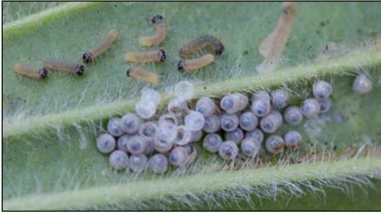
The correct host plants for females to lay eggs on and for caterpillars to eat are essential components of butterfly habitat. Invasive species can crowd out the host plants.

and many were simply sitting and basking in the morning sunshine. All of this was taking place in an area of less than an acre.