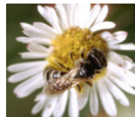
Sweat bee