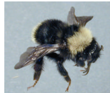
California bumble bee