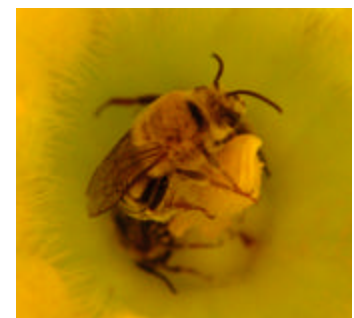
Squash bee