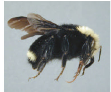
Yellow-faced bumble bee

have more than 200 workers in a nest. The other bees listed are ground-nesting solitary species. Sometimes, they nest together in large numbers, but each female works alone, digging tunnels underground in which she constructs cells to lay her brood.