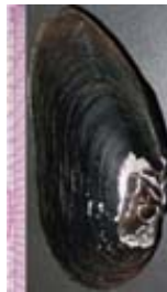
Margaritifera falcata (western pearlshell)