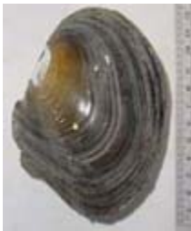
Anodonta nuttalliana (winged floater)