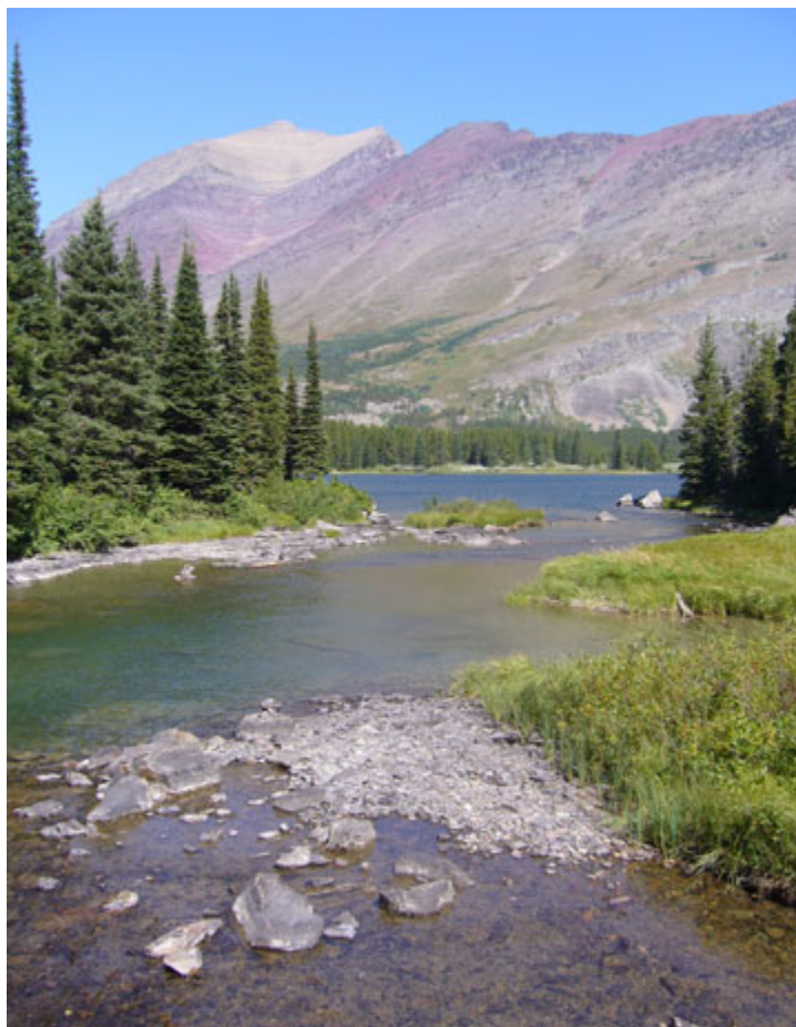
Cataract Creek below Grinnell Glacier, the type locality for Zapada glacier .