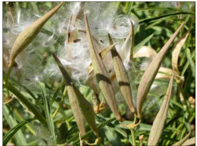
Narrow-leaved milkweed ( Asclepias fascicularis ): This species' fruits are hairless and have an elongated, tapered shape.