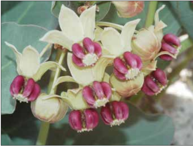
Pallid milkweed ( Asclepias cryptoceras ssp. cryptoceras ): The corona is purple and the corolla is pale green.