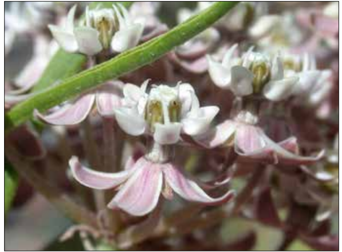
Narrow-leaved milkweed ( Asclepias fascicularis ): The corona is white and the corolla is pink.