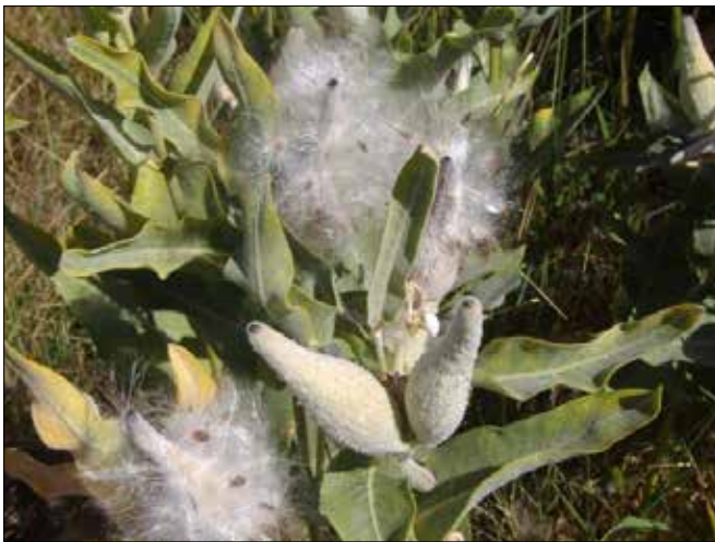
Showy milkweed ( Asclepias speciosa ): This species' fruits have a woolly texture and sometimes have warty projections.