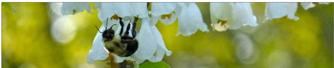
Two-spotted bumble bee ( Bombus bimaculatus) on silverbell ( Halesia diptera).