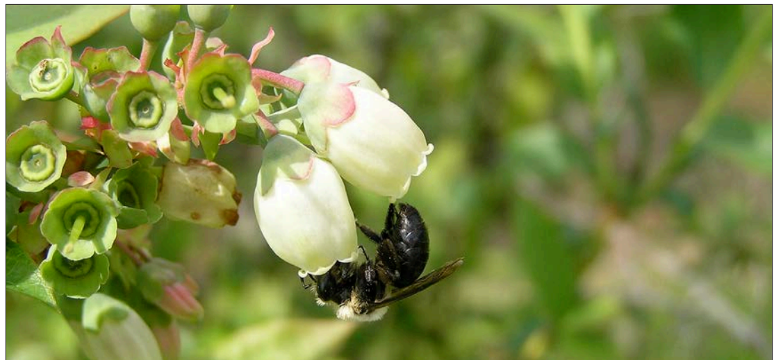
Native mining bee on highbush blueberry ( Vaccinium corymbosum).

We thank the photographers who generously allowed use of their images. Copyright of all photographs remains with the photographers. None of the photographs may be reproduced without permission from the photographer. If you wish to contact a photographer, please contact the Xerces Society at the address below.