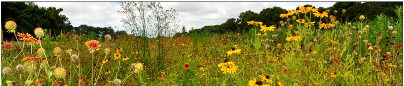
Figure 1 Hedgerow plantings for pollinators can serve other functions, such as habitat for wildlife or beneficial insects. This diverse mix of plants in South Carolina provides a variety of forage and nesting sites for native bees and more.