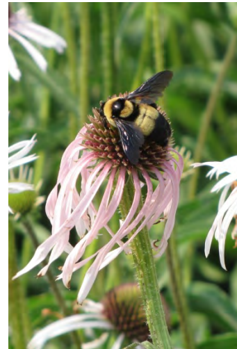
Bumble bee ( Bombus fraternus ) on pale purple coneflower ( Echinacea pallida ).

Keep in mind that small bees may only fly a couple hundred yards, while large bees, such as bumble bees, easily forage a mile or more from their nest. Therefore, taken together, a diversity of flowering crops, wild plants on field margins, and plants up to a half mile away on adjacent land can provide the sequentially blooming supply of flowers necessary to support a resident population of pollinators.