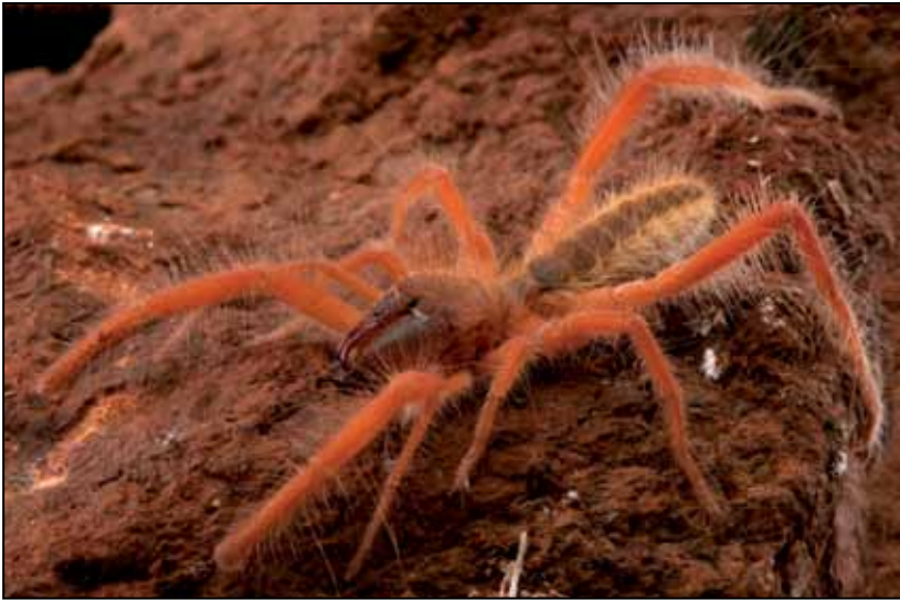
The body of a solifuge is covered with long hairs. These hairs are sense organs, capable of detecting the tiniest changes in temperature, humidity, or air movement.

The oldest fossil solifuge is from the Upper Carboniferous (Pennsylvanian) geologic period, approximately three hundred million years ago. These arachnids are notable for their massively powerful segmented jaws, voracious appetite, feisty temperament, and tremendous speed. They are important predators in harsh desert habitats throughout the world, preying upon any invertebrate large enough to provide sustenance or any vertebrate small enough to catch and subdue. And they themselves serve as food for lizards, scorpions, and other desert inhabitants.