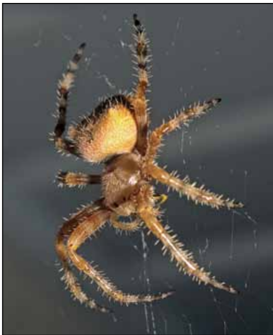
The Colorado Spider Survey is documenting the distribution and abundance of Colorado's spiders, even uncommon ones such as Araneus illaudatus .

many birds, including—somewhat unexpectedly—hummingbirds.