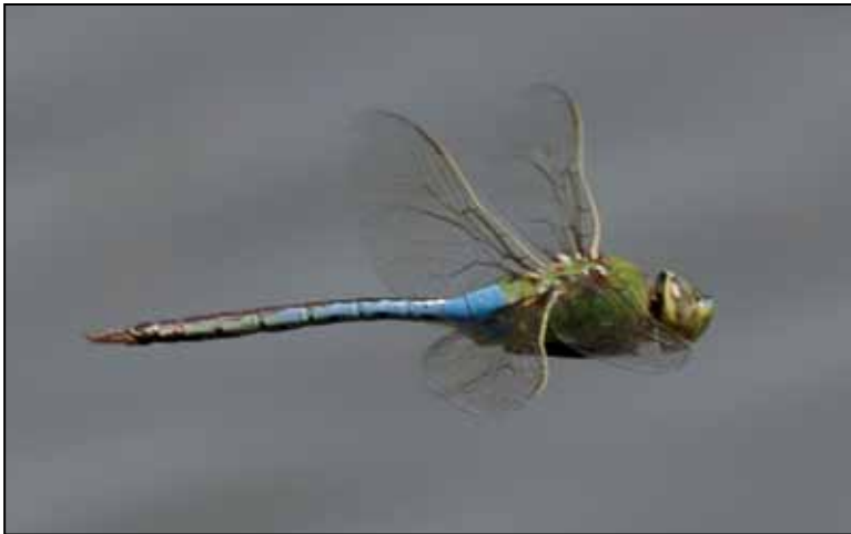
Sightings of the common green darner ( Anax junius ) reported by participants in citizen-science projects of the Migratory Dragonfly Partnership have expanded knowledge of the timing and extent of the species' movements.

These efforts have already yielded insight into dragonfly migration. Reports from volunteers are helping us understand patterns of dragonfly movement and visualize patterns of arrival