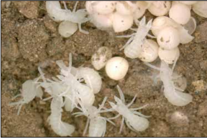
Camel spider nymphs clustered around hatched and unhatched eggs. These nymphal solifuges are relatively immobile and incapable of feeding.

capture whatever small prey is available (including each other). Only Eremobates mormonus has been successfully reared in the laboratory from egg to adult, with eight instars reported; estimates for species in other families range from four to eight instars before adulthood. The time of development for each stage depends on temperature, relative humidity, and time of hatching.