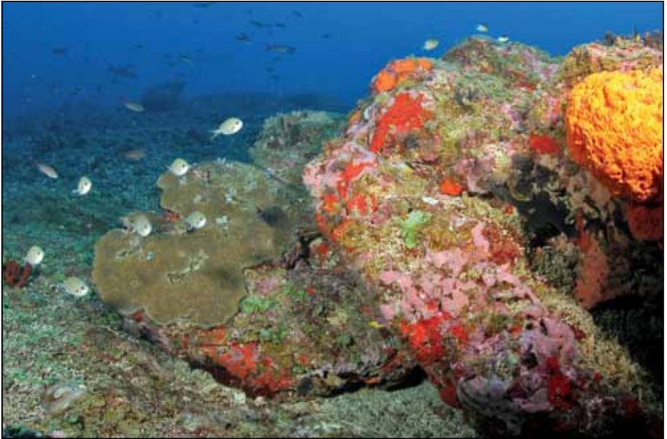
The Gulf of Mexico is one of the planet's most biodiverse water bodies. Coral reefs provide habitat for many species, including several of economic importance.

and adaptations. They range in size from microscopic zooplankton to the giant squid, reported to be up to twenty yards (eighteen meters) in length.