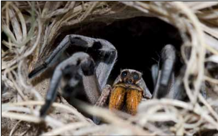
A burrowing wolf spider ( Hogna antelucana) watches from its lair. Wolf spiders have excellent vision for spotting prey and long legs with which to chase it down.

From the outset of the project some fifteen years ago, it has been important to help the participants stay connected and engaged over the long term, and one valuable tool has been our “arachnophile” distribution list. Twice a year, we send out a project newsletter, the Beat Sheet , which includes updates about the project; notices about upcoming classes, workshops, and lectures; announcements for paid and volunteer po-