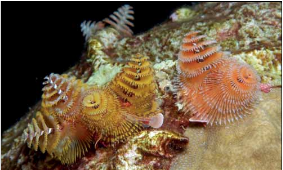
The feathery “branches” of the marine polychaete Christmas tree worm ( Spirobranchus giganteus ) have a dual purpose, collecting food and acting as respiratory organs. The remainder of the worm lives in a hole bored into the substrate.

Coral reefs have significant tourism value as sites for such activities as scuba diving, snorkeling, and recreational