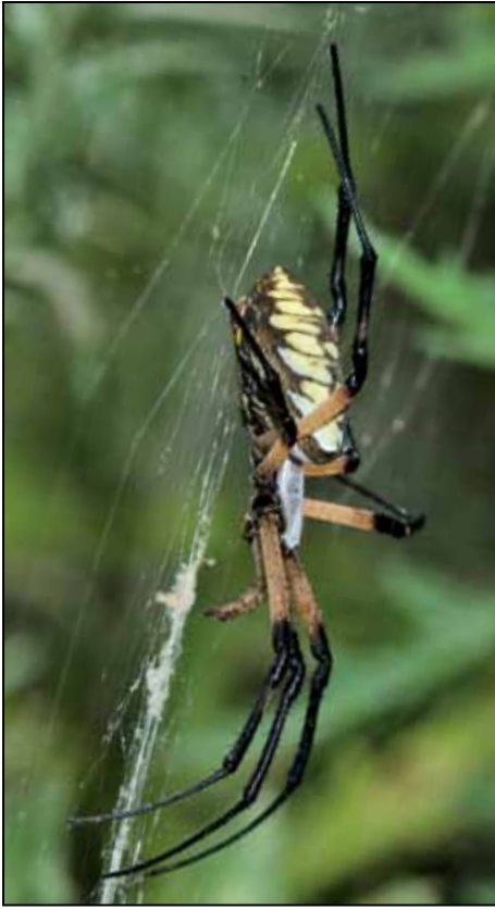
The black and yellow garden spider ( Argiope aurantia ), as its name implies, commonly weaves its web between garden plants.

sitions; participant news (adventures in the field, arachnid-related natural history observations, and other tidbits); and a section on “arachnids in the news.” Occasionally, participants who have been inactive for several years suddenly get back in contact and start sending in specimens again, almost certainly inspired by receiving the latest Beat Sheet .