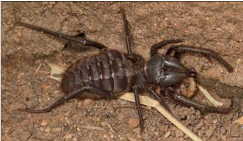
These large arachnids possess impressive chelicerae (jaws), but do not have venom glands. Photographed in Mozambique by Piotr Naskrecki.

In laboratory settings the time from hatching to first instar ranges from nine to twelve days. First instar nymphs resemble adults except for the absence of the malleoli on the rear legs. Remaining clustered, these nymphs are more mobile but appear not to feed until the molt to the second instar occurs, after which activity increases and aggressive behavior is apparent. At this stage, the young solifuges begin to hunt and