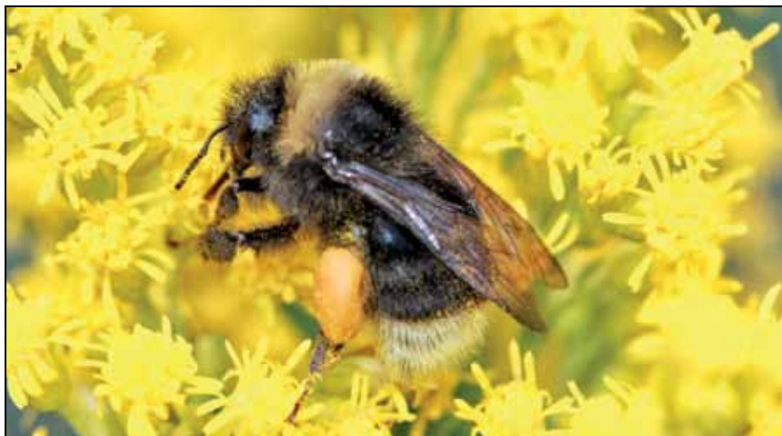
The Xerces Society's Pollinator Conservation Short Courses have trained hundreds of farmers and agency conservationists in ways to provide flower-rich habitats to sustain bees and other beneficial insects. Western bumble bee ( Bombus occidentalis ) foraging on goldenrod ( Solidago ), photographed by Rich Hatfield.

These courses have been made possible through the support of Sustainable Agriculture and Education grants in every region of the United States and with help from our partners at the Natural Resources Conservation Service. Now with staff scientists in five states from California to New Jersey, our pollinator conservation team is educating people about how to restore, enhance,