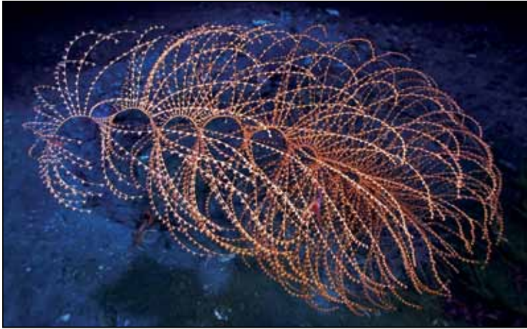
Gorgonian soft corals are a highly diverse and important part of deep-water communities. Photograph of Iridigorgia pourtalesii.

twenty years. When the Amoco Cadiz ran aground off the northwest coast of France in March 1978, spilling about 64 million gallons (242 million liters) of oil into coastal waters, high mortality of zooplankton was reported and ampeliscid amphipods were completely absent from sites where they had been the dominant population; it took eleven years for amphipods to recolonize impacted areas and reach pre-spill densities. Following the Ixtoc I spill, zooplankton suffered massive population decreases for three years. Soon after the North Cape grounded on the beaches of Rhode Island in 1996, spilling more than eight hundred thousand gallons (three million liters) of oil, nearly three million dead lobsters washed ashore.