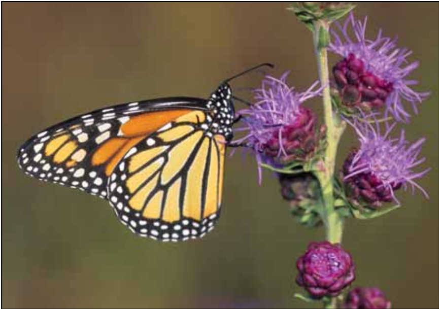
With a dedicated following of gardeners and advocates, the monarch is a flagship species for conservation. Steep declines in the butterfly's population mean that it may be missing from gardens in coming years. Monarch ( Danaus plexippus) nectaring on blazing star ( Liatris)

A few years ago, I gave a keynote talk on the status of North American butterflies at the International Butterfly Conservation Symposium in Reading, England. In preparation I compiled information about the continent's butterflies. The data from NatureServe, an organization that produces scientific assessments of biodiversity, suggested that more than 17 percent of butterfly