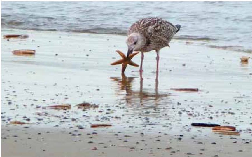
Oil compounds accumulate in invertebrates, and the contamination is passed up through the food web.

Invertebrates are already threatened by pollution, habitat degradation, and global climate change, and oil spills represent an additional persistent threat. We know that oil spills are having a negative impact on invertebrates even though this effect has not received widespread publicity. Oil spilled by the barge Florida in 1969 moved into marshes where it killed crabs, amphipods, worms, mollusks, and other benthic invertebrates, and continued causing harm for more than thirty years. Six years after the tanker Arrow ran aground off the coast of Nova Scotia in 1970, spilling 294,000 gallons (1.1 million liters) of oil into Chedabucto Bay, soft-shelled clams were still being exposed to oil trapped in sediments, and their populations were consistently lower at oiled locations; impacts to benthic invertebrates were documented for