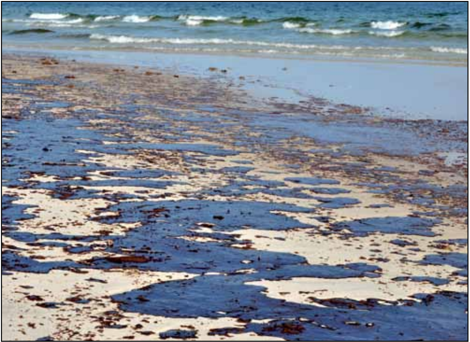
More than 200 million gallons of oil are spilled into the oceans each year. Oil-coated shores are an obvious result, but most of the oil is dispersed into the marine ecosystem, where it can have decades-long impacts.

they play critical roles in essential ecological processes. Despite their importance, the vast majority of marine invertebrates are poorly known. According to Spineless: Status and Trends of the World's Invertebrates , a report produced by the International Union for Conservation of Nature (IUCN) and the Zoological Society of London, there are between 200,000 and 230,000 described marine species, with more than two million estimated to exist in total. Invertebrates make up more than 95 percent of all marine animal species. Living in a wide range of habitats, from tropical waters to the polar seas and from the surface to the deep ocean, marine invertebrates display a vast diversity of forms, sizes,