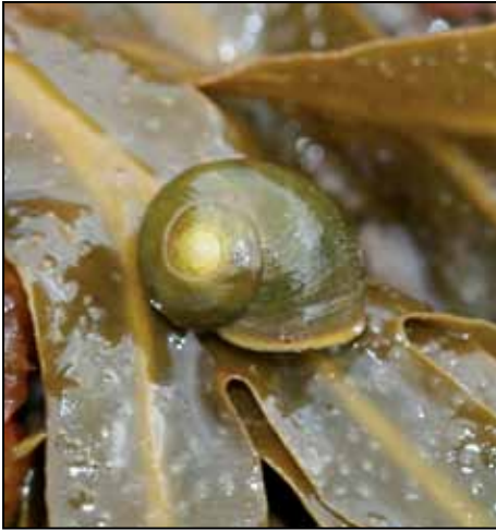
Gastropods such as the flat periwinkle ( Littorina obtusata ) are common in intertidal environments, and thus vulnerable to oil contamination of shorelines.

deepwater habitats, which may extend the impacts on invertebrates by decades.