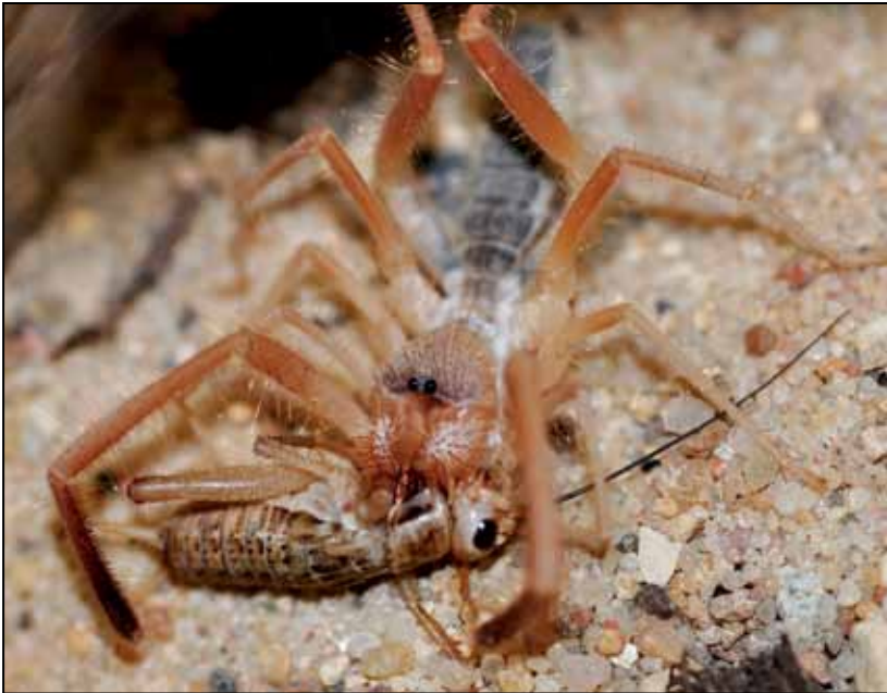
Camel spiders are agile predators, using their great speed to run down prey, including insects, reptiles, and small mammals. Eremobates pallipes feeding on a cricket, photographed by Jen Rowsell.

Like most other arachnids, solifuges have two major body segments: a prosoma (also called the propeltidium), which combines the head and thorax, and an opisthosoma (also called the abdomen). The overall length of these animals ranges from slightly less than one inch (two and a half centimeters) to more than four inches (ten centimeters), including the legs. Attached to the prosoma are the chelicerae (or jaws), as well as a pair of leg-like pedipalps and four pairs of legs. The pedipalps are covered in setae (sensory hairs) that probably serve to detect vibrations, odors, and chemical cues in the environment.