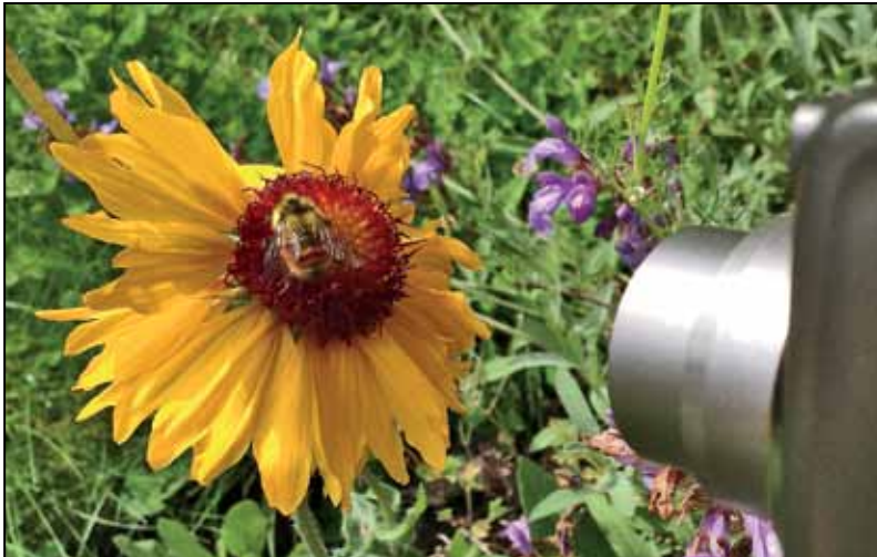
Learn about North American bumble bees—and help protect them—by participating in Bumble Bee Watch.

Bumble Bee Watch is a partnership between the Xerces Society, Wildlife Preservation Canada, the University of Ottawa, the Montreal Insectarium, the Natural History Museum in London, and BeeSpotter.