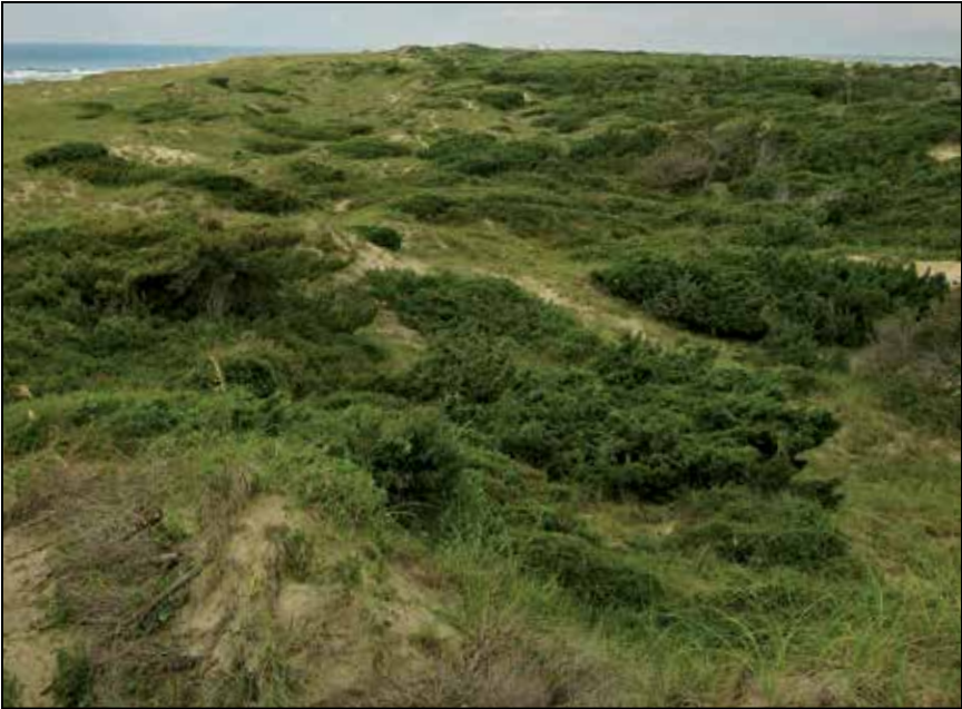
A thirty-mile stretch of barrier islands fringing North Carolina’s coast is the only known home of the crystal skipper. Increasing development is fragmenting the butterfly’s habitat. Photograph by Allison Leidner.

make it to a new area, would they be able to reproduce successfully? Perhaps all of this questioning is a fancy way of asking: “Would the butterfly cross the road? And if it did, would it survive on the other side?”