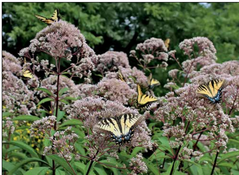
When planted to create a mass of color, flowers are more likely to attract butterflies—though maybe not as many swallowtails ( Papilio ) as shown in this garden on sweet Joe Pye weed ( Eutrochium purpureum )!

There is a place for nonnative plants in a garden, though, so if you are a lover of catmint or majoram or English lavender, don't despair. They can serve as good nectar sources, but, if you do plant nonnative species, please be care-