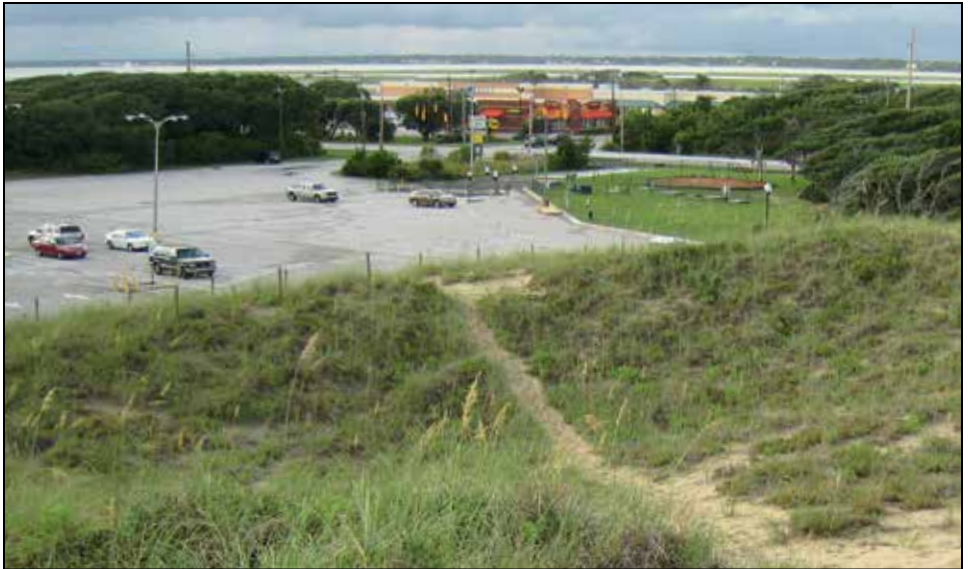
The author marked and released butterflies to see whether they would fly across developed areas. They would, for at least a quarter of a mile.

Each of these studies individually points in a similar direction, but taken together they provide clear evidence of the importance of stepping stones of habitat—disconnected patches scat-