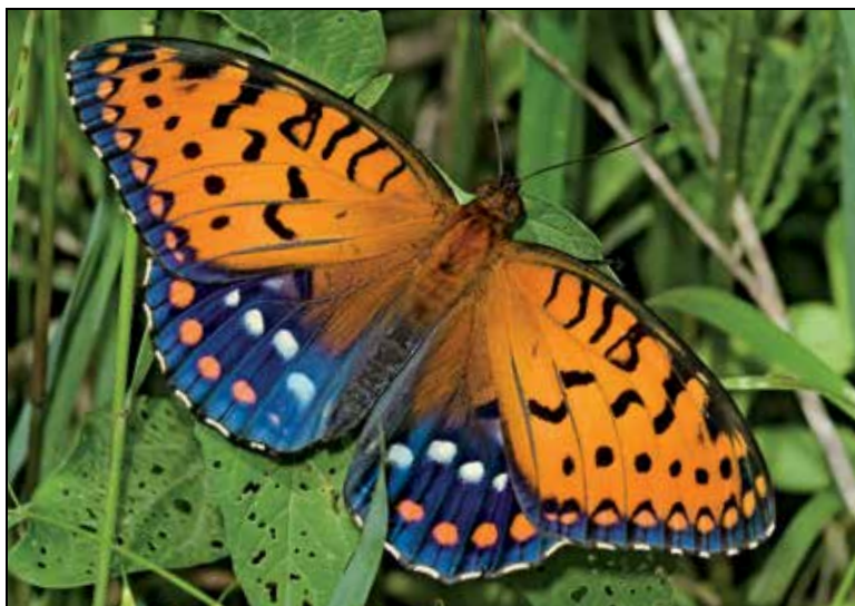
The regal fritillary ( Speyeria idalia ) was at one time found in thirty-two U.S. states, and now appears to be secure in only one.

With more than eighteen thousand species of butterflies and ten times as many species of moths gracing our planet, we know relatively little about the status of each one, but the information