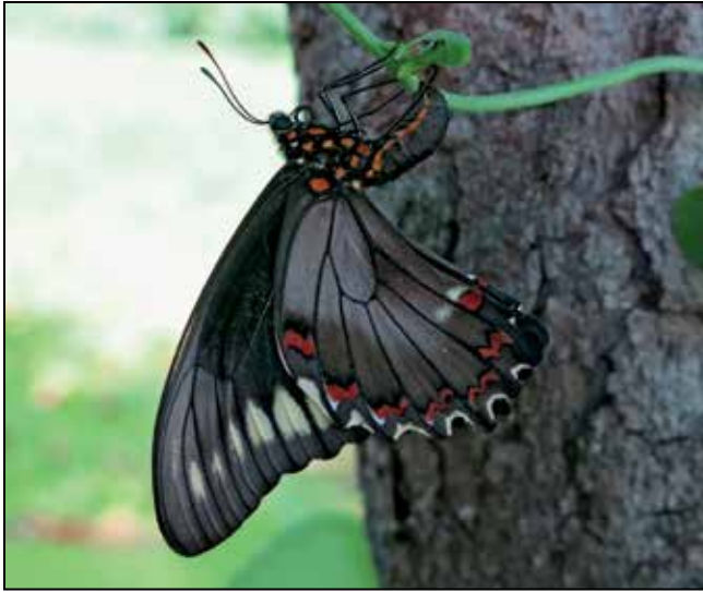
The right plants can support butterflies in shaded areas. Polydamas swallowtail ( Battus polydamas ) laying eggs on pipevine ( Aristolochia ).

ful never to use invasive species even if they attract butterflies. Lantana ( Lantana ) and purple butterfly bush ( Buddleja davidii ), for example, are two butterfly-attracting shrubs that are identified as noxious weeds in some states.