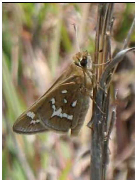
The crystal skipper completes two generations in a year. Adults may be seen during spring and again in summer.

Habitat restoration and creation are also critical. The Army Corps of Engineers dredges shipping channels and maintains access to ports in the region, with the result that a number of islands that were once wetlands are now filled with dredge spoil. Since these areas will not be restored back to marshes, planting seaside little bluestem to make them favorable for the crystal skipper offers some benefit. Staff at the Rachel Carson Reserve (which is within the North Carolina Coastal Reserve and the National Estuarine Research Reserve) planted seaside little bluestem on an infilled wetland in 2008 and expanded the planted area in 2011. Crystal skippers are now found at this location as well as in an area on the western edge of the reserve where seaside little bluestem naturally colonized dredge spoil. Similar grass-planting efforts could be promoted on barrier islands. Additionally, there is an increasing interest in using natural methods to protect coastal development from storms, particularly in the face of climate change and the associated rise in sea level, and towns along the North Carolina coast are planting dune grass-