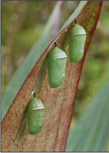
Chrysalises of the monarch ( Danaus plexippus ).

plants, then, is to ask garden-center staff what their plants have been treated with, since you will not want to purchase plants that have been treated with systemics. Nurseries that grow their own stock, and native-plant nurseries in particular, will be in a better position to provide such details, while retail outlets may not have this information available. You should avoid buying plants from any source that cannot verify that they are free from systemic pesticides.