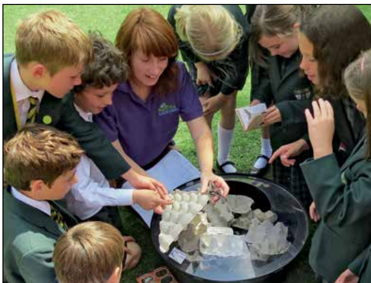
Schoolchildren from Chard in southern England discover the wonders of the moth trap as part of one of Butterfly Conservation's education projects, Munching Caterpillars.

There is no doubt that Britain's butterflies and moths face great challenges, but Butterfly Conservation is standing strong and working hard on their behalf.