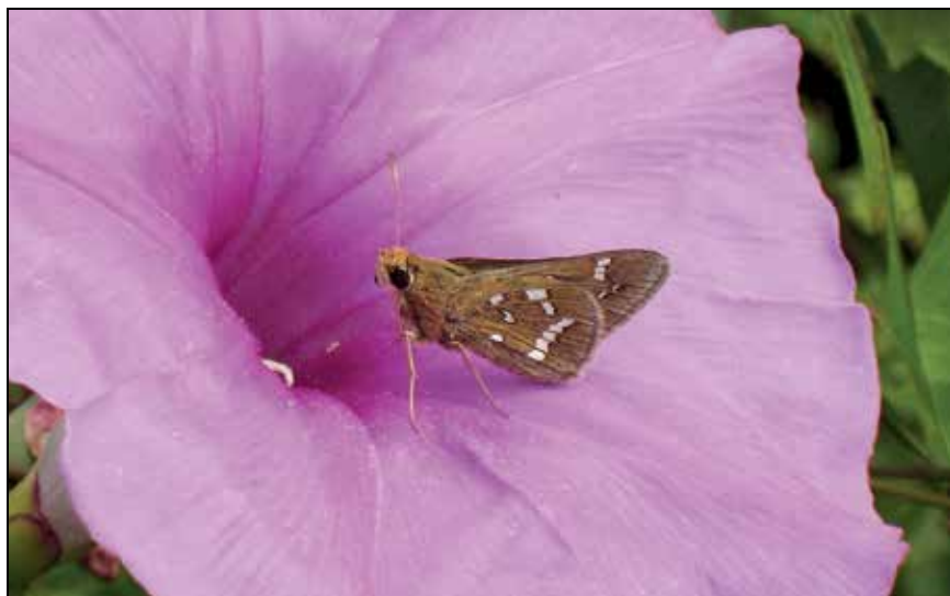
Given the common name “crystal skipper” by the author in the mid-2000s, this butterfly did not gain an official name— Atrytonopsis quinteri —until last year, nearly four decades after it was discovered.

My research focused on three questions: Would crystal skippers leave sand dunes and fly through unfamiliar areas? If they did leave their habitat, how far would they fly? And, finally, if they did