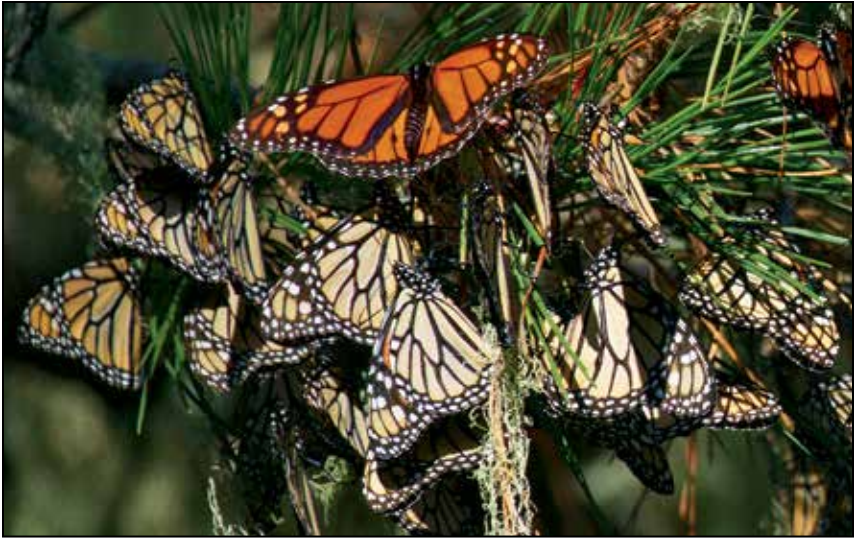
The Xerces Society's most recent count of monarchs overwintering in California tallied some 292,000 butterflies.

hosted overwintering monarchs for the first time; and still other sites were occupied that had not seen monarchs for years. In Marin County, in the northern extent of the overwintering range, two new sites each supported more than eight thousand butterflies.