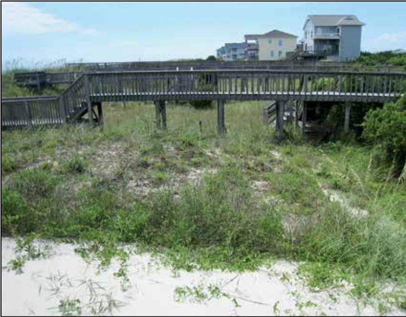
The skipper's host plant grows in a narrow strip behind the main line of dunes. Although this is prime real estate, adequate habitat may remain when houses are set back from the beach.

es to facilitate the formation of dunes at the back of the beach. Behind those dunes, seaside little bluestem could be planted to support skippers.