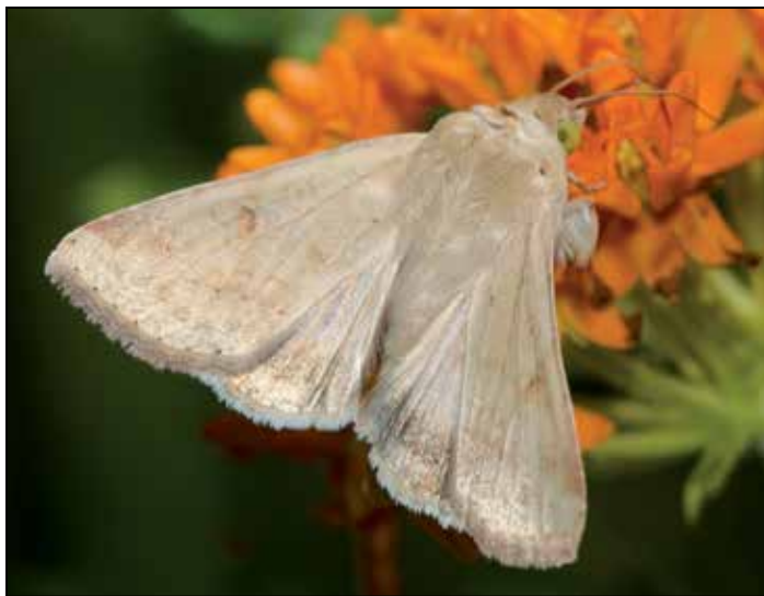
Moths make up the larger portion of Lepidoptera. We know even less about how well they are faring in North America than we do about the state of butterflies.

be too late. We already know that the future health of the planet requires a thoughtful and sensitive reconciliation between the human environment and the more natural one. Policies that could accelerate that reconciliation are desperately needed; at the same time there is much that we can do, as individuals, while we as a society work for those policies to be enacted.