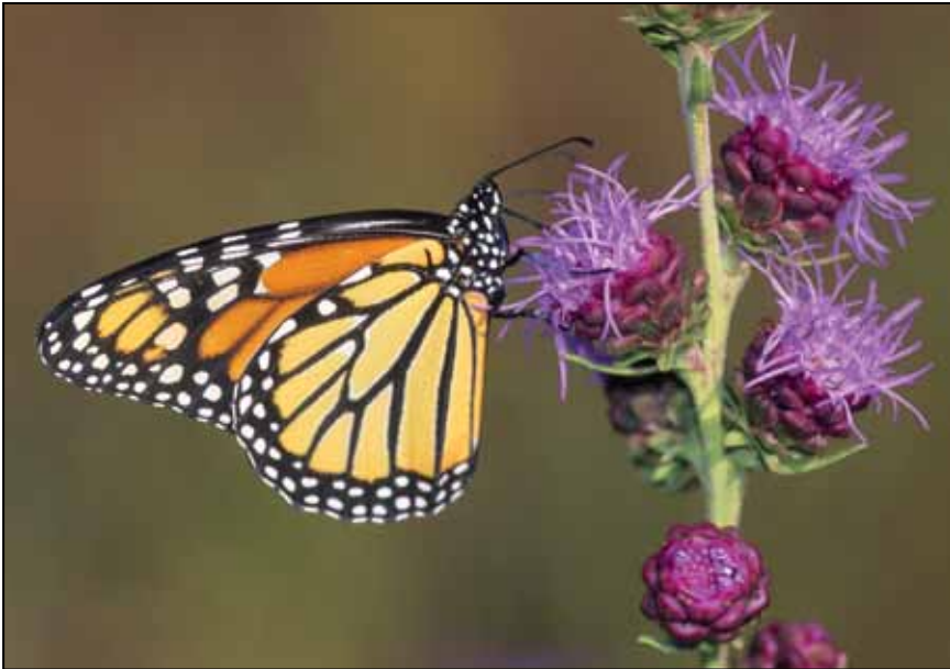
With a dedicated following of gardeners and advocates, the monarch is a flagship species for conservation. Steep declines in the butterfly's population mean that it may be missing from gardens in coming years. Monarch ( Danaus plexippus) nectaring on blazing star ( Liatris)

A few years ago, I gave a keynote talk on the status of North American butterflies at the International Butterfly Conservation Symposium in Reading, England. In preparation I compiled information about the continent's butterflies. The data from NatureServe, an organization that produces scientific assessments of biodiversity, suggested that more than 17 percent of butterfly