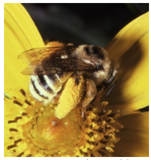
Long-horned bee

Bumble bees are social insects. They nest in small cavities, usually old rodent burrows. The queens start new colonies early each spring and by mid-summer may have more than 200 workers in a nest.