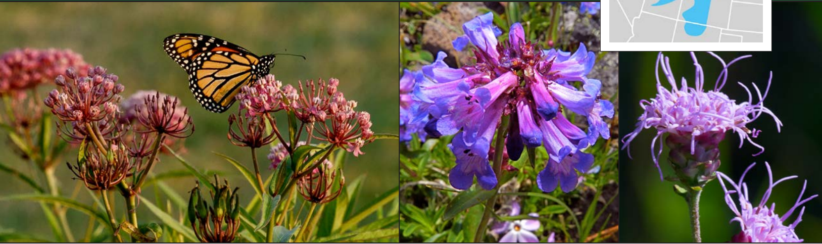
Left to right: Monarch on swamp milkweed, littleflower penstemon, and Rocky Mountain blazing star.

The Rocky Mountains region spans large sections of Idaho, Montana, Wyoming, Utah, Colorado, and New Mexico. It is characterized by some of the tallest mountains in the continental U.S. and is home to diverse forests, serpentine river canyons, and high alpine zones. A huge variety of plants and wildflowers, from tiny alpine blooms to large stands of rabbitbrush and goldenrod, can be found in this region. These plant communities support numerous pollinators and other wildlife, including summer-visiting monarch butterflies.