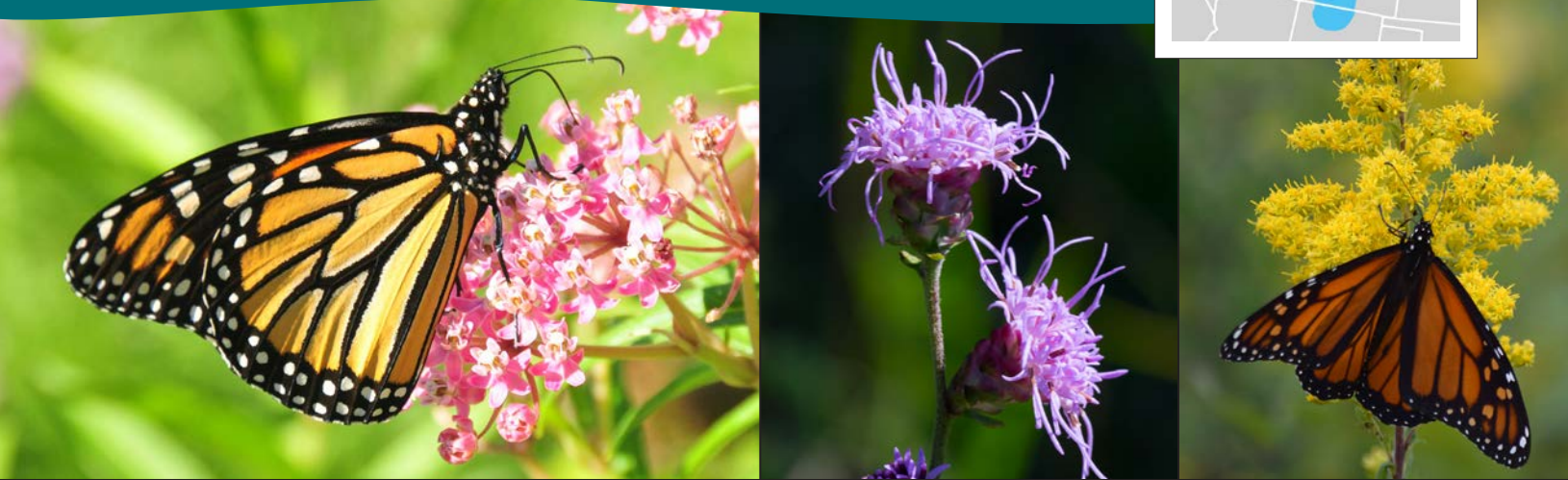
Left to right: Monarch on swamp milkweed, Rocky Mountain blazing star, and monarch on Canada goldenrod.

The Rocky Mountains region spans large sections of Idaho, Montana, Wyoming, Utah, Colorado, and New Mexico. It is characterized by some of the tallest mountains in the continental U.S. and is home to diverse forests, serpentine river canyons, and high alpine zones. A huge variety of plants and wildflowers, from tiny alpine blooms to large stands of rabbitbrush and goldenrod, can be found in this region. These plant communities support numerous pollinators and other wildlife, including summer-visiting monarch butterflies.