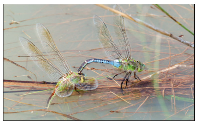
Adult dragonflies may fly large distances, but they return to water to lay eggs. Common green darners, photographed by Bryan E. Reynolds.

The complete migratory circuit is multi-generational, with at least three generations of the common green darner involved. Members of the first generation move north in the spring from a broad region that stretches as far south as Central America and Puerto Rico, and lay eggs at their northern destination in the United States and Canada. The second generation emerges and moves south in late summer or fall. Those migrants produce a non-migratory population in the south that eventually gives rise to the next generation of northbound dragonflies, which migrates the following spring.