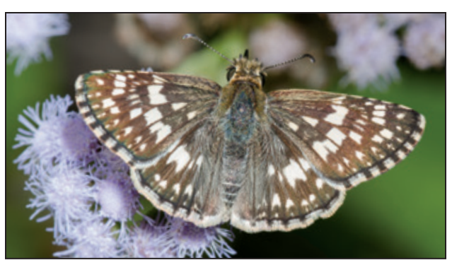
White checkered-skipper ( Pyrgus albescens ) nectaring on mist flower.