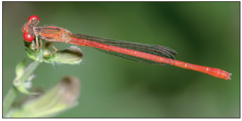
The head of a damselfly is significantly wider than its body, with its eyes widely spaced on the sides of its head. Desert firetail, photographed by Bryan E. Reynolds.

of damselflies are similar in size. In the field (or park, garden, or pond) you'll see that, with some exceptions, dragonflies hold their wings splayed out perpendicular to their bodies while perched, and the difference in wing size is noticeable. In contrast, most damselflies fold their wings together, parallel to their bodies, with their similar-size wings fitting neatly over each other (the exceptions are the spreadwing damselflies, which hold their wings apart and at an angle to their bodies).