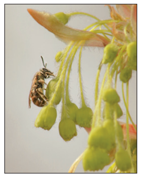
Trees have been called "meadows in the sky" because of their huge number of flowers. The author had the rare chance to study bees in the canopy.

Slowly and steadily, I ascend to the strong crotch near the top of the tree, where the rope, which was flung up there using a giant slingshot before I began climbing, loops back to the ground. This is as high as I can go. I'm at about sixty-five feet, with a side view of the branches of oak, tulip tree, and the occasional sugar maple reaching to the sky. Some have begun to push out their sweet, pea-green, early spring leaves, while others are still bare twigs displaying only buds or early flowers. Midstory red maple, hop hornbeam, and black cherry grab the sunshine between them in the airspace below. My body gets accustomed to the regular swaying of the branches, and I wave to Greg, who is now tiny, distant on the dappled forest floor.