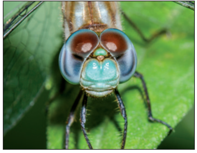
A dragonfly's face is dominated by huge compound eyes, which often touch or nearly touch at the top. Blue-faced meadowhawk, photographed by Bryan E. Reynolds.

The feeding behavior of nymphs may help dictate where a particular dragonfly is found within its habitat. As with adults, some nymphs possess large eyes, which aid in detecting and capturing prey. The eye specializations of dragonfly nymphs are to some extent parallel with their behaviors. For example, nymphs possess different ways of capturing prey depending on the species, with some actively searching for a meal and others lying hidden in wait. Those that actively search are generally visual predators with large, complex eyes, while others, with smaller eyes, may be largely sedentary, using tactile or olfactory cues to detect prey. Cryptic species, those that hide, may be found among vegetation or buried within sediment, with their eyes often the only visible hint that they lie beneath. Some species