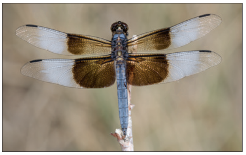
Dragonflies typically rest with their wings spread, and have a clearly noticeable difference in size between their forewings and hindwings. Widow skimmer.

Dragonflies can be found near just about any water body in North America. Most of the common, widespread species readily observed are habitat gener-