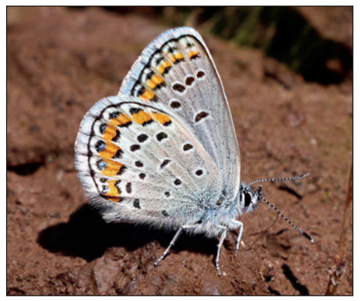
Both male and female Melissa blue butterflies have beautiful iridescent markings on the undersides of their wings.

ants would sit on a stem or leaf, twitching their antennae intently rather than dashing up and down the plant. These ants were protecting superbly camouflaged caterpillars of the Melissa bluestout, bright green, with yellowish lines along their bodies, they would easily be overlooked if not for the ant sentries. These caterpillars, like aphids, produce honeydew; in exchange for this sweet reward the ants will attack anythingincluding predators like the lady beetles -that come near. The world is a dangerous place for caterpillars, and this beneficial interaction is one way they protect themselves.