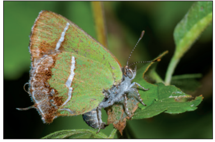
Silver-banded hairstreak laying eggs. In the United States, this butterfly is found from California to Texas as well as in Florida.

vital to our conservation efforts at Xerces. How can you protect or restore habitat for a species unless you know where and how it spends its life? Take a butterfly, for instance. Does it have one generation a year, or two, or more? How long does it take for the butterfly to go through its cycle from egg to caterpillar to chrysalis? Does the species overwinter (or oversummer during droughts) as an egg, caterpillar, or chrysalis? What host plant (or plants) does its caterpillars eat, and therefore on which does the butterfly lays its eggs? Where does that host plant grow-wet areas? disturbed areas along roadsides?-and when does it grow? Are there any special require-