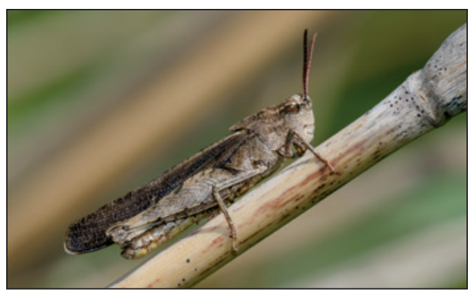
Grasshoppers are an important component of the food web of grassland ecosystems.

This past year Xerces made significant progress engaging with the Bureau of Land Management and the U.S. Fish and Wildlife Service—federal agencies involved with the APHIS pesticides program. Most notably, the Idaho BLM office halted insecticide applications except within one mile of croplands at risk from severe grasshopper or Mormon cricket pressure. This action protected 4.6 million acres of public lands.