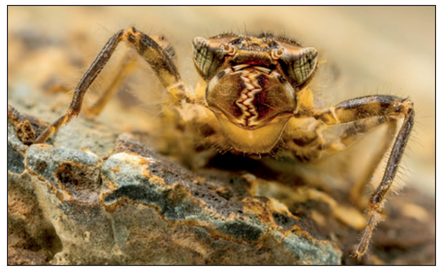
The arrowhead spiketail is a dragonfly of the eastern United States. Its nymphs, like this one, live in spring-fed forest streams.