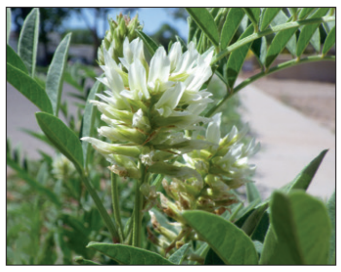
Careful observation of the activity on wild licorice growing at the edge of a parking lot helped reveal fascinating connections between insects.

Fortunately for the wasp, the Melissa blue is a fairly widespread species across most of the western states and Great Plains. I hope that the wasp