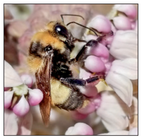
Crotch's bumble bee ( Bombus crotchii ).

Unfortunately, a consortium of large commercial agricultural commodity and pesticide groups, led by the Almond Alliance, sued the State of California, trying to make the case that insects could not be protected under CESA. The initial case in county court decided in favor of the commodity groups. That ruling was successfully appealed by the State of California, the Xerces Society, and partners, a decision that was upheld when the commodity groups took the case to the Supreme Court of California, which ruled that the state can protect insects.