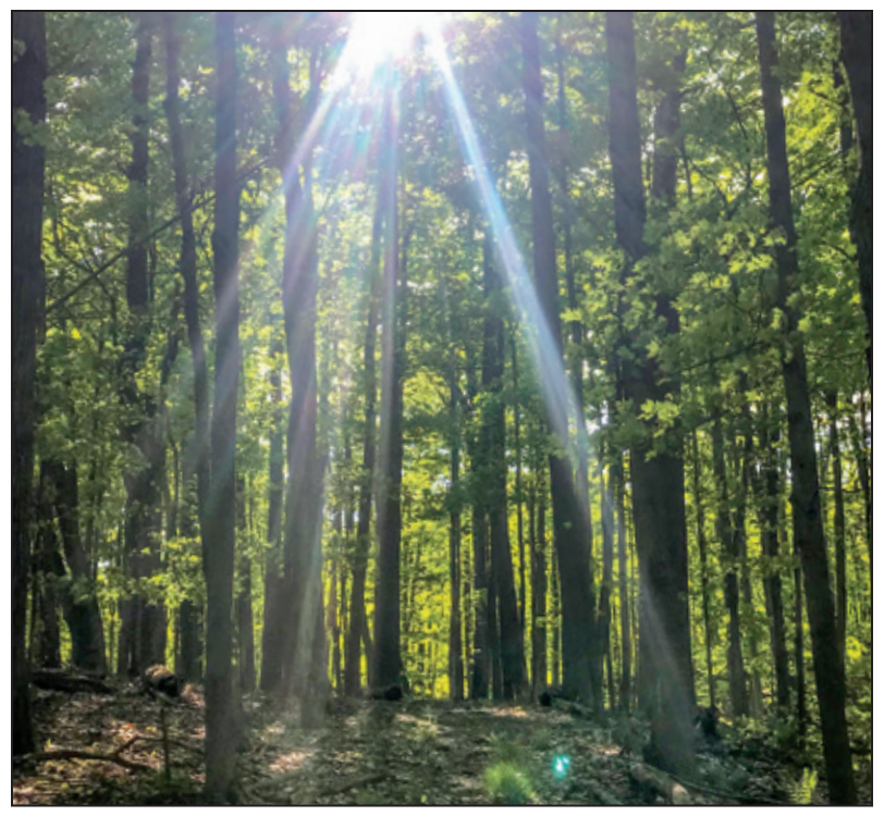
By the time forest trees leaf out in late spring, there has been a burst of activity from bees foraging on the flowers blooming on the forest floor and in the canopy.

A slight breeze rustles the branches overhead, and I take the first big step of my long vertical climb.