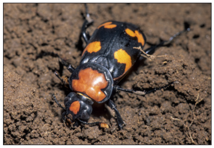
The American burying beetle is still crawling thanks to the Endangered Species Act. Its decline may be tied to the disappearance of the passenger pigeon.

One of the most basic tasks of natural history is documenting these interactions between species—who preys on whom, which insects feed on which plants. Without this knowledge, we