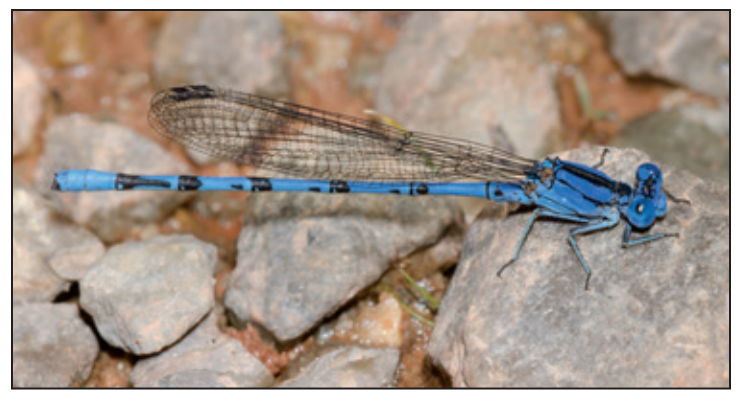
Damselflies are more slender than dragonflies, but no less colorful. Most will hold their wings over their bodies when perched. Springwater dancer.

alists and may be found around all types of water, from ponds to roadside ditches. Others are habitat specialists and are associated with specific aquatic habitats; one must know their preferences to locate them. Some are associated with lowland fens, others with montane bogs, and still others with seeps trickling from rocky outcrops. Large streams, too, are not without dragonflies, and a stream species' aquatic stage can be well adapted to the relentless tumult of running waters.