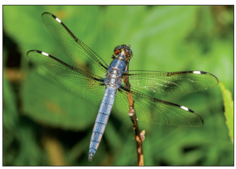
Dragonflies are an indicator of the health of both aquatic and terrestrial habitats. Spangled skimmer