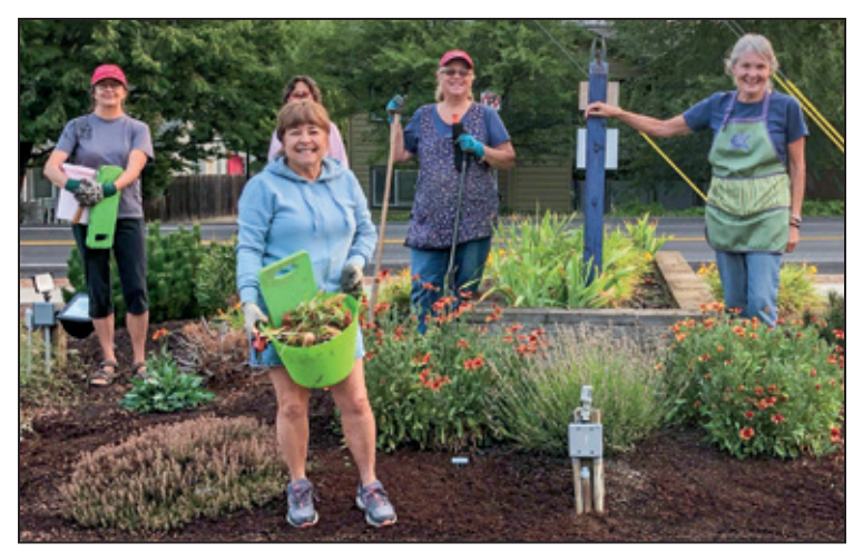
For ten years, Bee City USA has united communities around a shared desire to help pollinators.

efforts accomplished a great deal in 2021, the last year for which affiliate reporting has been completed.