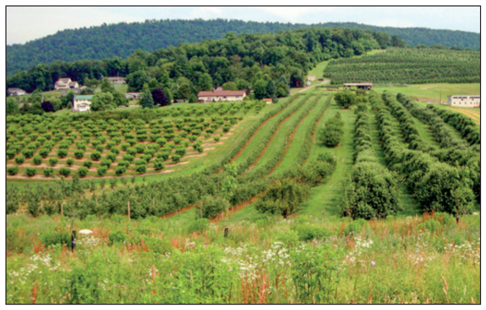
Orchards that are adjacent to forests have more diversity and abundance of bees. In the early spring the forests support bee populations, which then move into the orchards when the fruit trees bloom.

transitioned to include both canopy pollens and lots of apple pollen. It was obvious that many bees moved from the forests to the orchards during apple bloom.