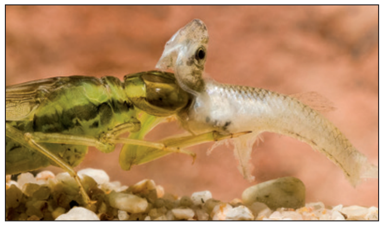
Damselfly and dragonfly nymphs live underwater. Their remarkable extending mouthparts enable them to catch a range of prey, including small fish. Common green darner.

do not fall neatly within these groups, and others may employ different feeding modes depending on the environment; for example, if fish are present nymphs that actively hunt may opt for cryptically lying in wait, presumably to avoid predation themselves.