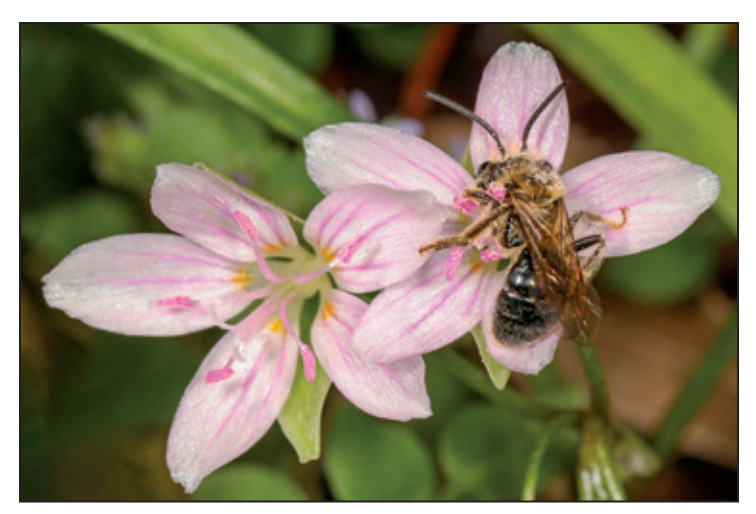
The spring beauty mining bee forages only on spring beauty, a wildflower that blooms on the forest floor early in the year. By the time the tree canopy leafs out, the flowers and the bees disappear, and the cycle repeats the next year.

Shift your gaze from the flowers toward the leaf litter, and you're perfectly poised to find bees scouting for nest sites. Bumble bee queens, having mated in the fall and hibernated all winter, diligently pursue their need to establish nests. I usually see bumble bees searching for nest sites in the woods, on welldrained, sloping hillsides that are cov-