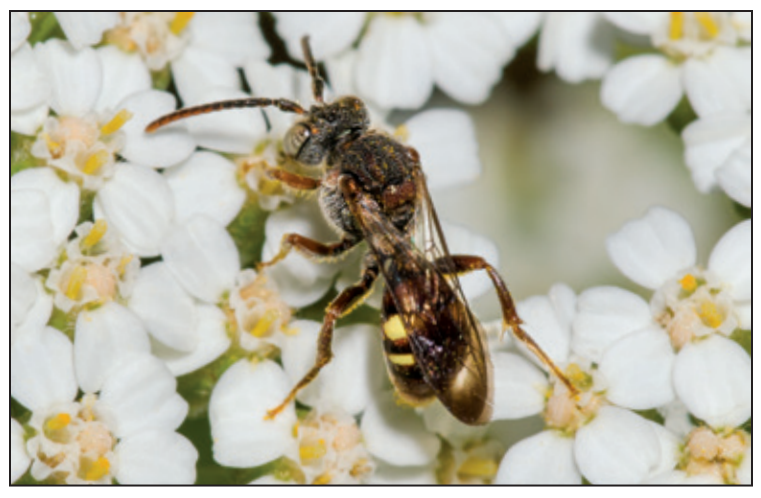
Cuckoo bees in the genus Nomada , commonly called nomad bees, do not make their own nests. They lay eggs in the nests of other bees, frequently those of mining bees.

The next strategy for forest-bee spotting: if it's green and glinting, check it out! Many forest insects are gorgeously iridescent, probably because their sheen confuses predators when they fly between dappled sun and shade. Two of my favorite forest bees shimmer in the dappled light: the metallic green Augochlora pura and the shiny blue Lasioglossum coeruleum. They're active all summer, have generalist diets, and will usually build their burrows in abandoned beetle holes of an eighth to five-sixteenths of an inch (three to eight millimeters) in diameter in dead wood. Stumps, standing snags, and debris are crucial habitat for these bee species. Other stem- and cavity-nesting bees, such as mason bees, also using pre-