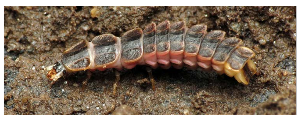
Firefly larva.