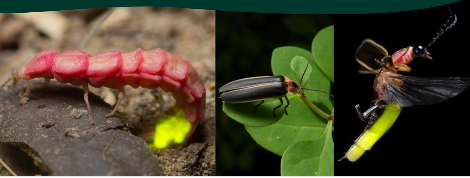
Fireflies need safe places to hunt, shelter, mate, and overwinter. By eliminating pesticide use, you can help protect the habitats they need to thrive.

Few sights signal the beginning of summer like the flashing of fireflies at dusk. Yet these evening spectacles may be blinking out due to various threats, including habitat loss, light pollution, and pesticide use. Indeed, pesticides are believed to be second only to habitat loss and fragmentation as a cause of firefly declines (Lewis et al. 2020). While research on specific pesticide risks to fireflies is limited, several studies suggest that chronic exposure to commonly used insecticides such as neonicotinoids and organophosphates can harm fireflies. Furthermore, studies on related insects allow us to infer that many pesticides may negatively impact firefly populations. By understanding the firefly life cycle, their specific needs, and the threats they face from pesticides, you can take direct action at home to help conserve their populations.