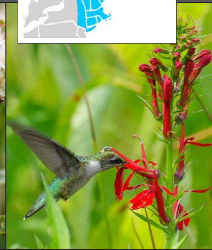
Highbush blueberry, ninebark, and cardinal flower

The Northeast Region encompasses southern Quebec, New Brunswick, Nova Scotia, the New England states, and eastern New York. High regional variation in topography, soils, and climate translates to tremendous ecological diversity, ranging from the coastal dunes and tidal ecosystems along the Atlantic shoreline, to the spectacularly species-rich deciduous forests and riparian communities of the Appalachian Highlands.